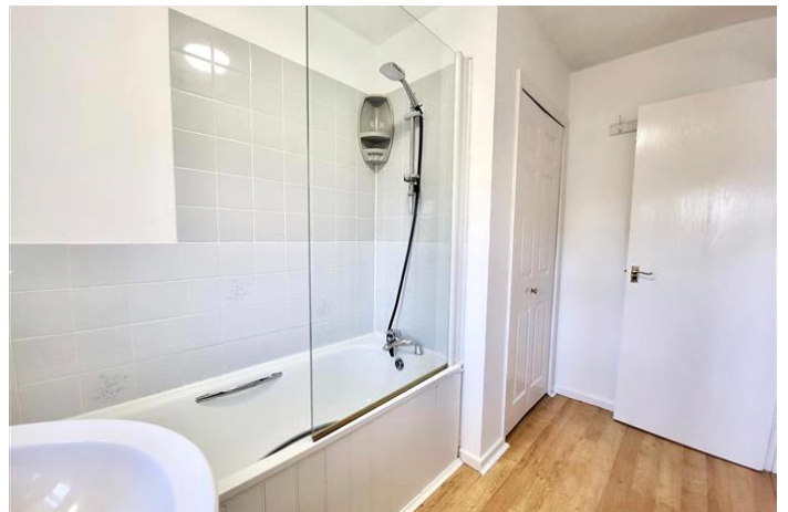
HOME ORCHARD, YATE, BRISTOL £1,095 PCM