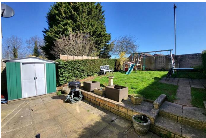
OAK CLOSE, YATE, BRISTOL £1,350 PCM