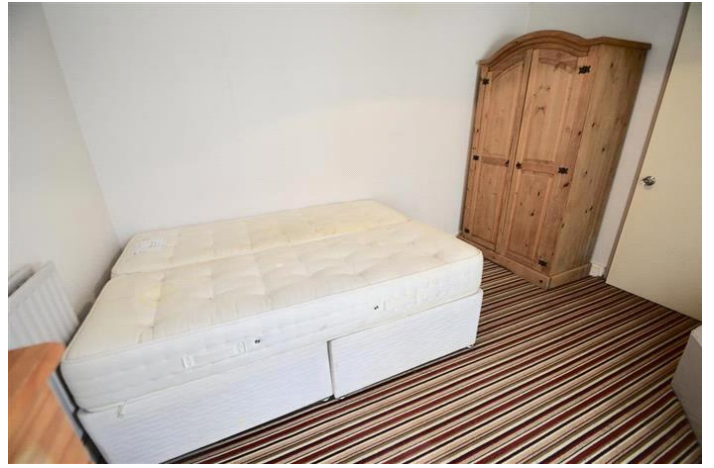
HERCULES CLOSE, LITTLE STOKE, BS34 6JE £550 PCM