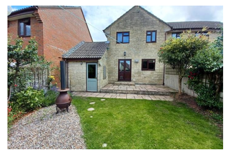
LILLIPUT COURT, CHIPPING SODBURY, BRISTOL £1,450 PCM