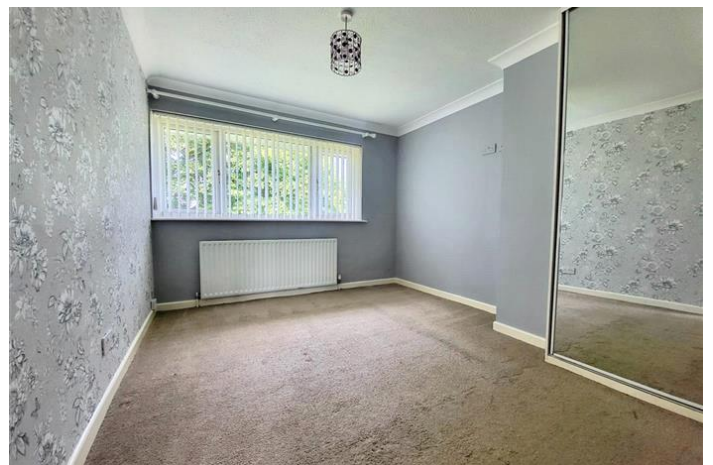
ROBIN WAY, CHIPPING SODBURY, BRISTOL £1,495 PCM