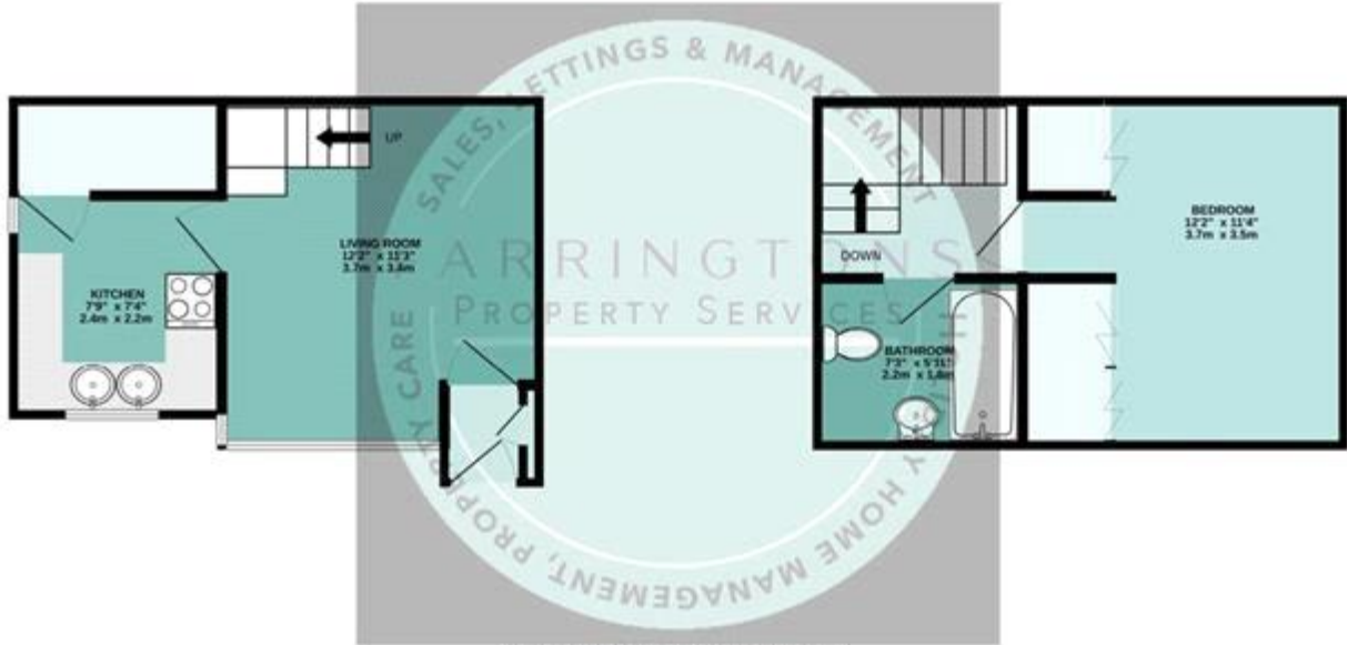
TOTAL FLOOR AREA: 450 sq ft. (41.8 sq.m.) approx.

Whilst every attempt has been made to ensure the accuracy of the floorplans contained here, measurements of doors, windows, rooms and any other items are approximate and no responsibility is taken for any error, omission or mis-statement. This plan is for illustrative purposes only and should be used as such by any prospective purchaser. The services, systems and appliances shown have not been tested and no guarantee as to their operability or efficiency can be given. Made with Metropix ©2023