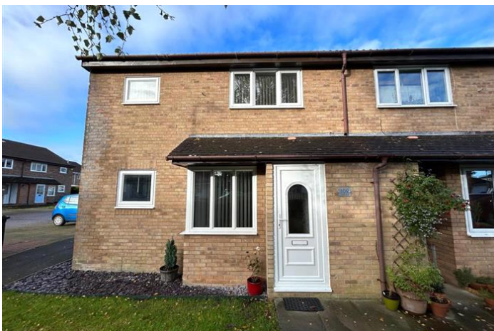
LONGS DRIVE, YATE, BRISTOL £185,000 Freehold