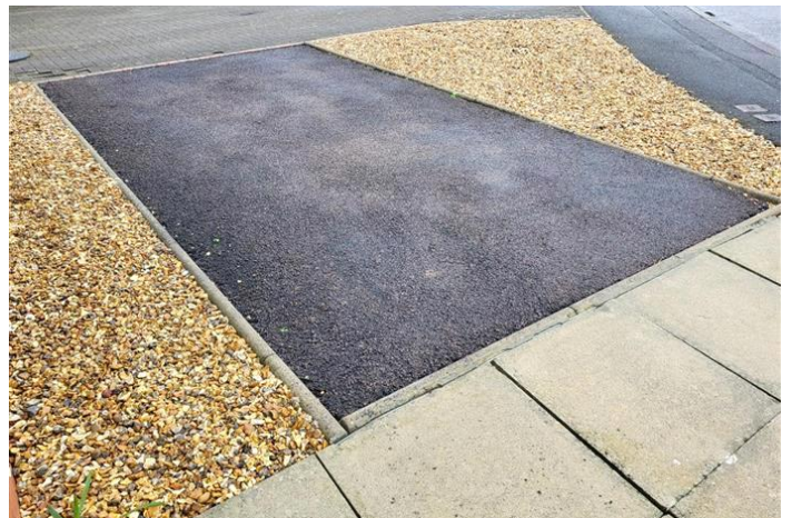
HOME ORCHARD, YATE, BRISTOL £1,250 PCM