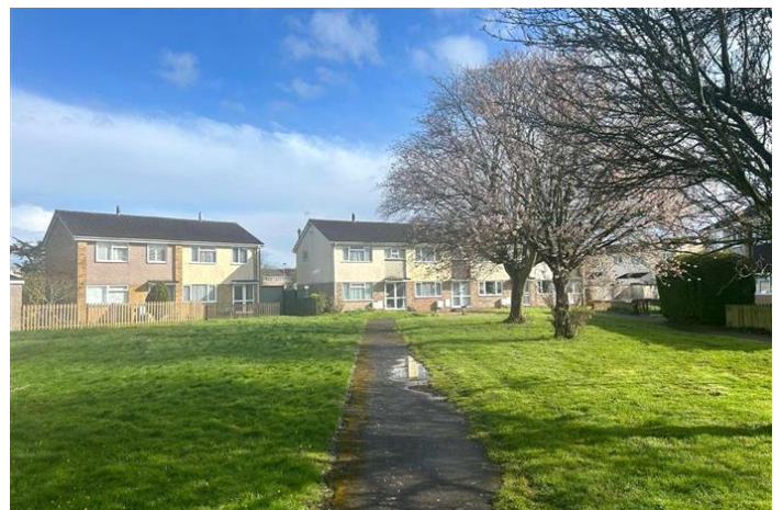
CHARGROVE, YATE, BRISTOL £190,000 Leasehold