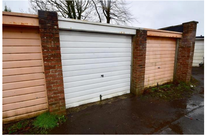
CANTERBURY CLOSE, YATE, BRISTOL £975 PCM