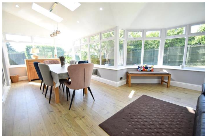
THE DINGLE, YATE, BRISTOL £625,000 Freehold