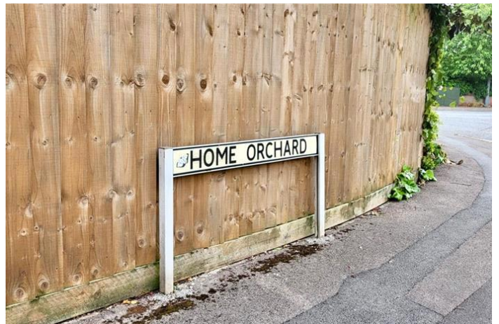
HOME ORCHARD, YATE, BRISTOL £1,100 PCM