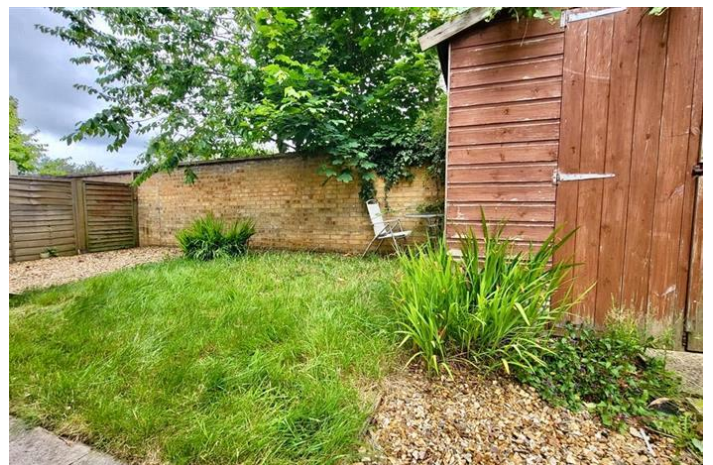
CHEDWORTH, YATE, BRISTOL £1,150 PCM