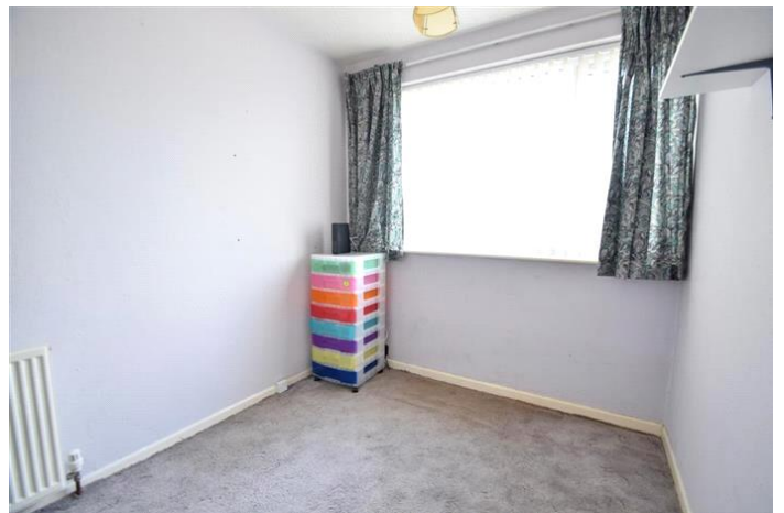
NAILSWORTH AVENUE, YATE, BRISTOL £340,000 Freehold