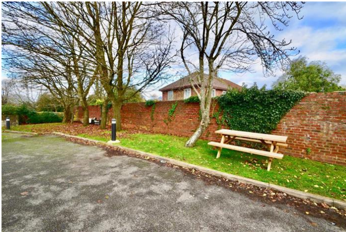
THE LAWNS, YATE, BRISTOL £1,100 PCM