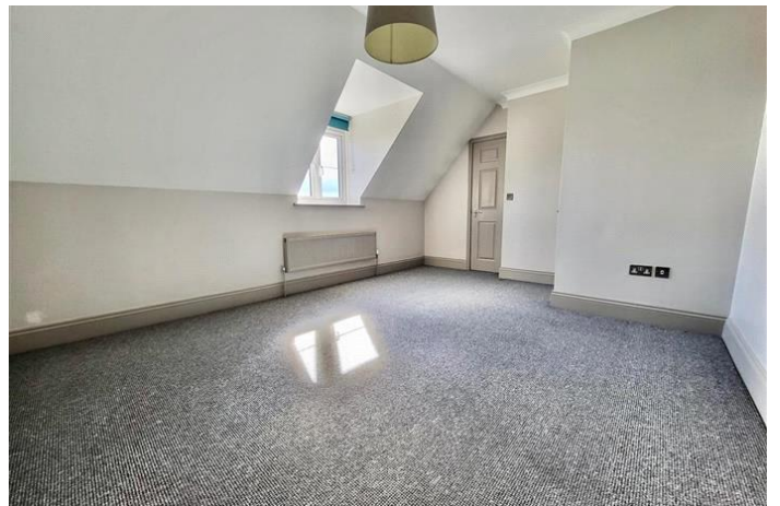
KILN TERRACE, GLOUCESTER STREET, WOTTON-UNDER-EDGE £1,500 PCM