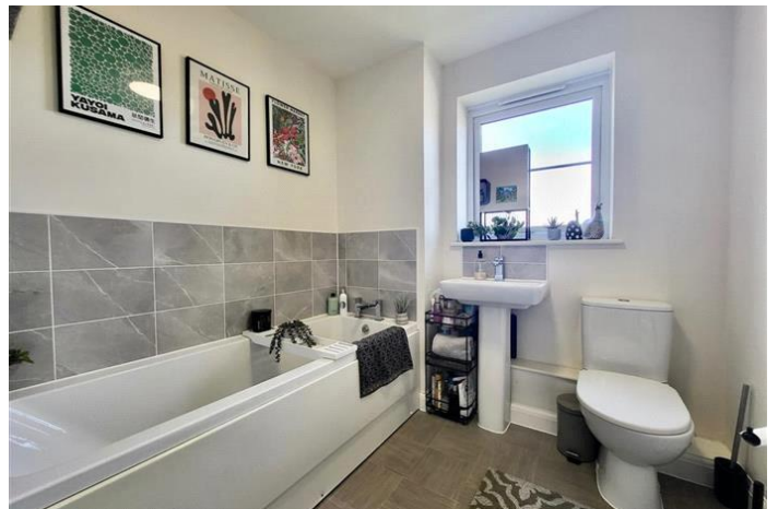
CLARK DRIVE, YATE, BRISTOL £1,300 PCM