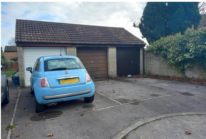
YORK CLOSE, YATE, BRISTOL £270,000 Freehold