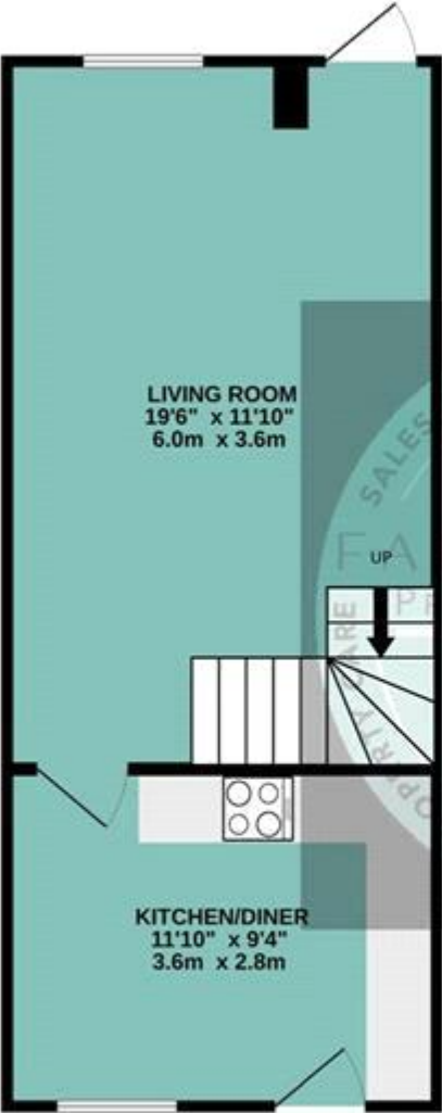
GROUND FLOOR 340 sq.ft. (31.6 sq.m.) approx.