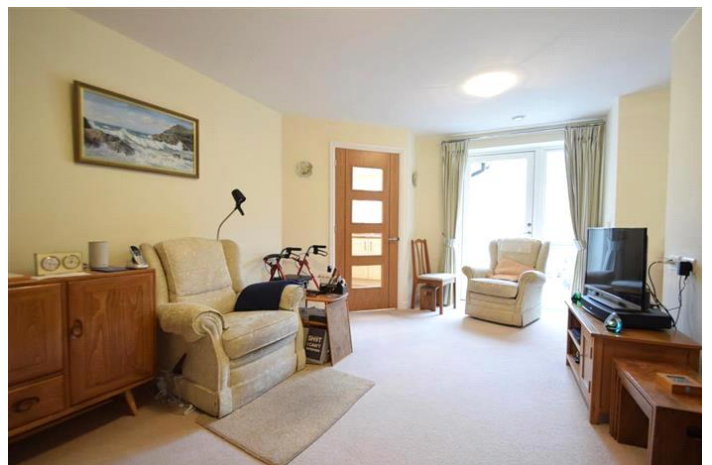
BARNHILL COURT, BARNHILL ROAD, CHIPPING SODBURY, BRISTOL £350,000 Leasehold