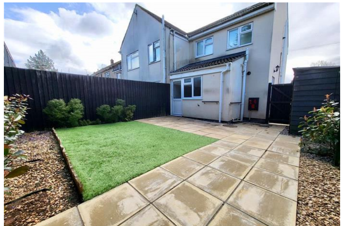
WINDSOR DRIVE, YATE, BRISTOL £915 PCM