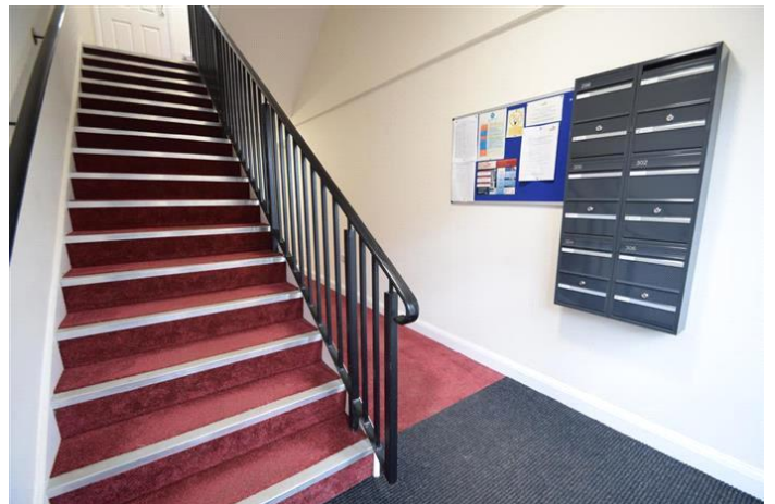
DOWSELL WAY, YATE, BRISTOL £225,000 Leasehold