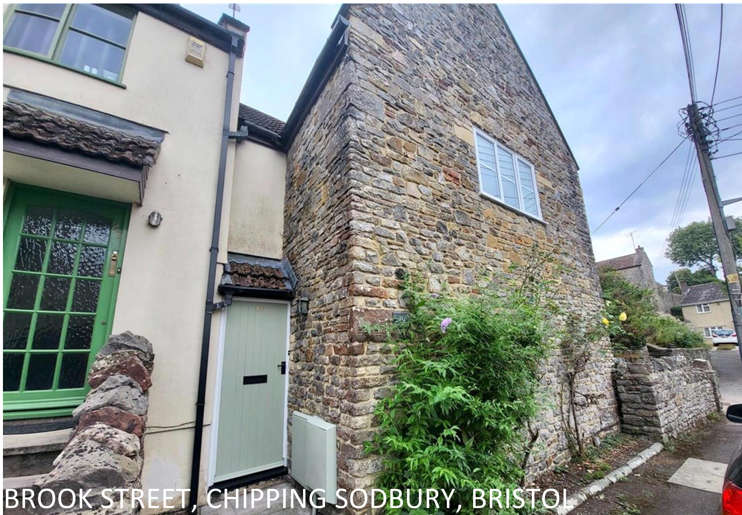
BROOK STREET, CHIPPING SODBURY, BRISTOL