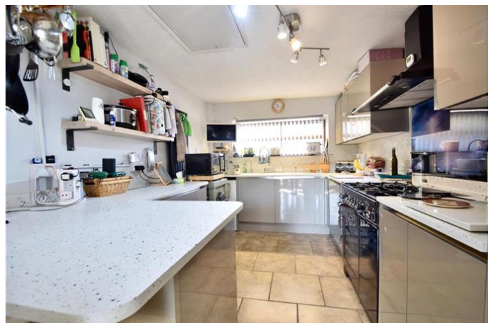
REDBERRY COTTAGE, STATION ROAD, WICKWAR, WOTTON-UNDER-EDGE £595,000 Freehold