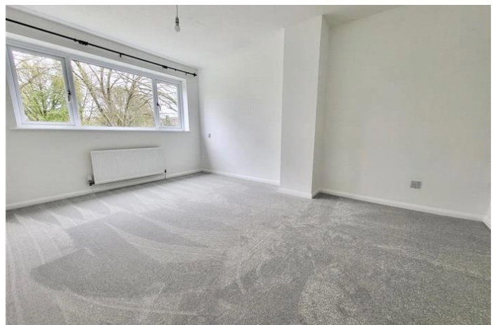
ROBIN WAY, CHIPPING SODBURY, BRISTOL £1,500 PCM