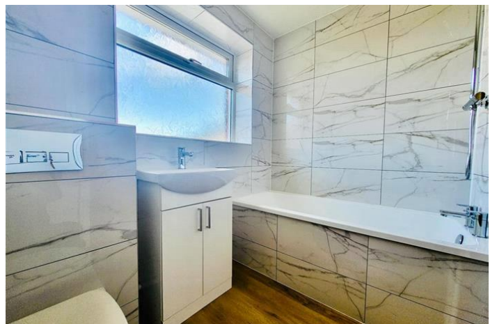
LONGFORD, YATE, BRISTOL £1,550 PCM