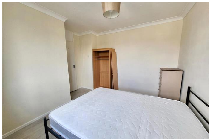
KINGSCOTE, YATE, BRISTOL £700 PCM