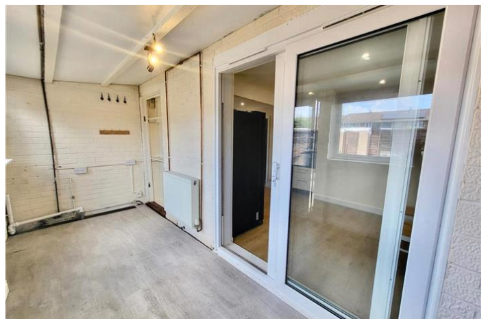
KINGSCOTE, YATE, BRISTOL £725 PCM