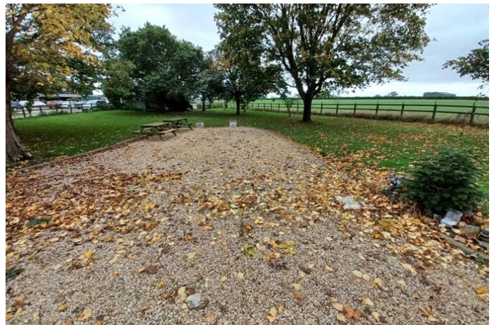
THE ANNEXE, PINCOTS FARM, PINCOTS LANE, WICKWAR, WOTTON-