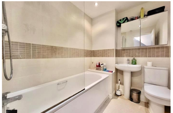
BANKSIDE, BROAD LANE, YATE, BRISTOL £1,850 PCM