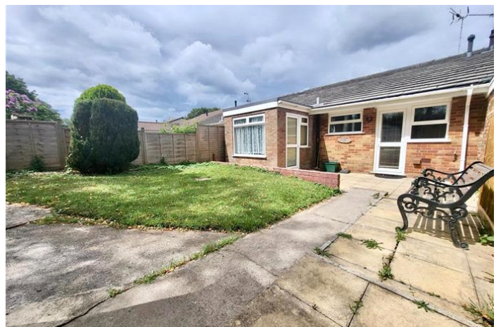
KENILWORTH, YATE, BRISTOL £1,295 PCM