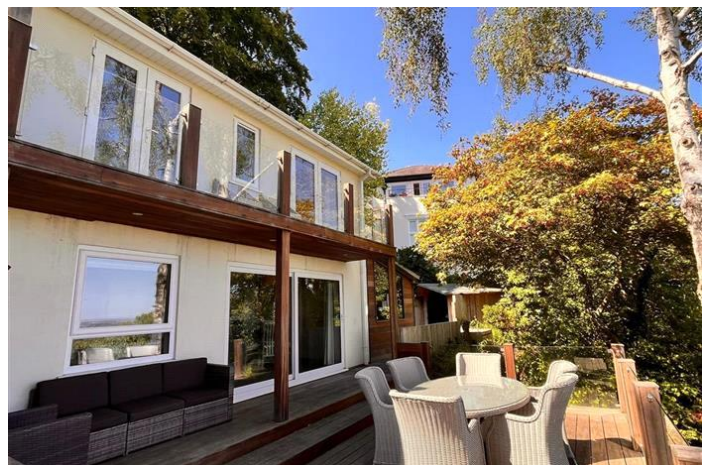
HOLYWELL ROAD, MALVERN £1,850 PCM