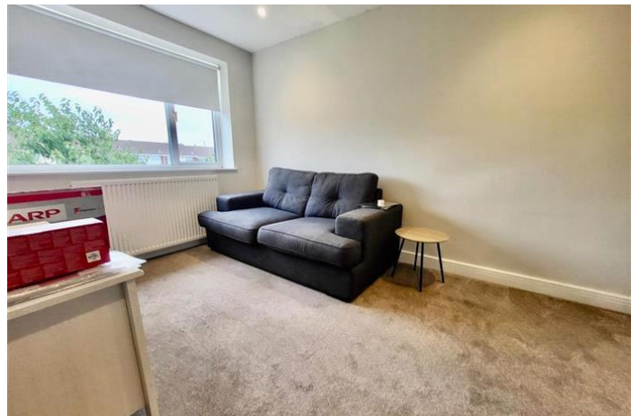
HATHERLEY, YATE, BRISTOL £1,275 PCM