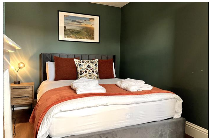
THE NOOK, ALKERTON, EASTINGTON, STONEHOUSE £2,000 PCM