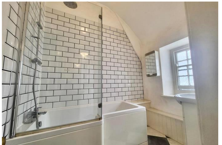
HIGH STREET, BERKELEY £995 PCM