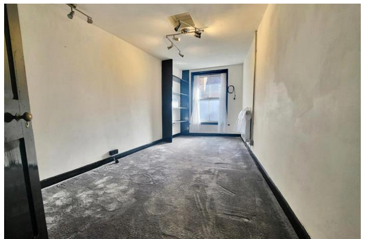
YE OLDE HOUSE, HIGH STREET, BERKELEY £1,295 PCM