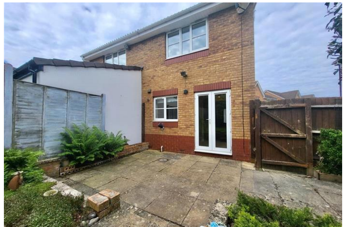
COOPERS DRIVE, YATE, BRISTOL £1,295 PCM