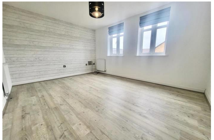
FLETCHER ROAD, YATE, BRISTOL £1,595 PCM