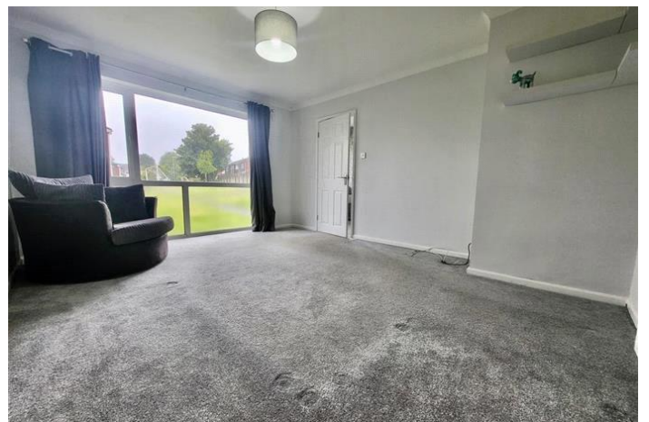
GLENFALL, YATE, BRISTOL £1,625 PCM